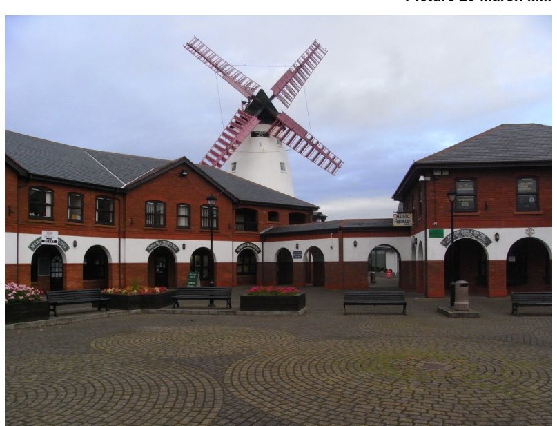
Table 12 Civic spaces

Civic spaces provide focal points within settlements, usually in the centres. This may be for a particular type of gathering, such as at a war memorial, or may be for general pedestrian use or outdoor markets such as within town centre areas. The distribution reflects the existence of either pedestrianised shopping areas or war memorials, but also in Wyre due to the particular nature of the borough with its coast, the main promenade areas provide important civic space. Only those promenade areas which are used in the way described by the PPG17 typology are included in this category; those sections which just form linear paths between places are listed as green corridors. There are also some small hard-surfaced areas which function as small meeting places. The sites included are listed in Table 12 below: