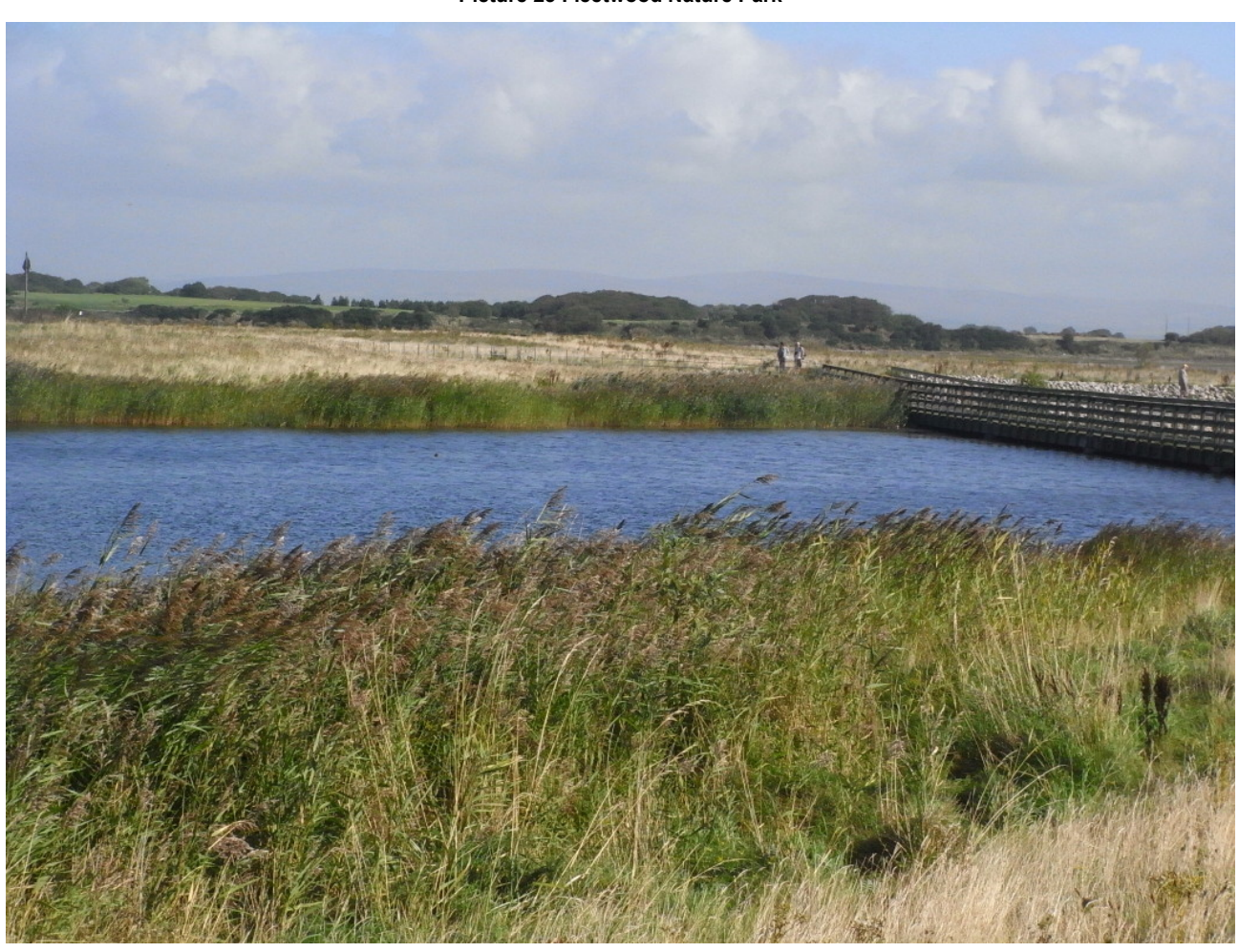
Table 11 Natural and semi-natural greenspaces