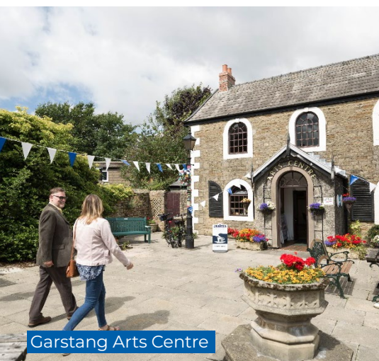
Garstang Arts Centre