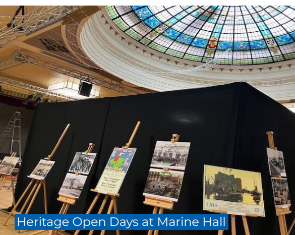
Heritage Open Days at Marine Hall

Culture and Heritage also encompasses the sum of habits, skills, traditions, customs, religion, and beliefs of our past and present communities. All of these can often be part of our everyday life in some way and are subsequently passed to us by our immediate family or our ancestors and often have a historic, cultural or social significance be it locally, regionally or nationally. It is important that heritage and culture engages as wide an audience as possible through a variety of historic and creative industries.