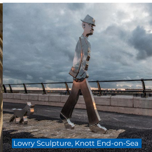
Lowry Sculpture, Knott End-on-Sea