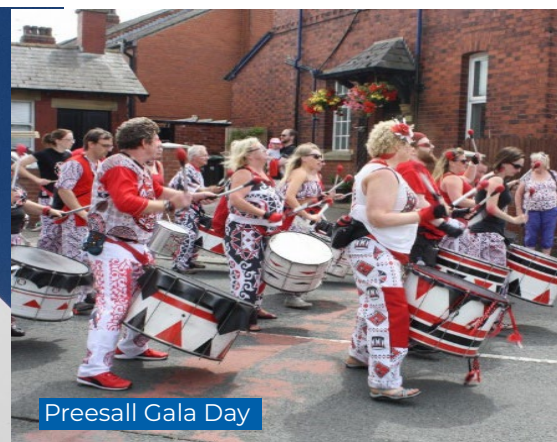
Preesall Gala Day