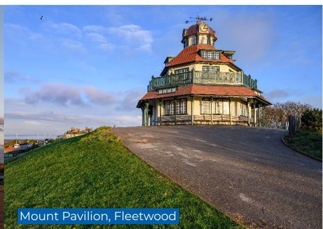
Mount Pavilion, Fleetwood