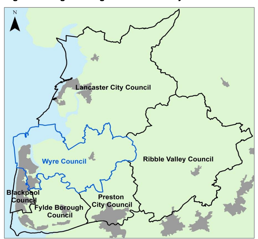
Figure 1: Neighbouring Authorities to Wyre Council