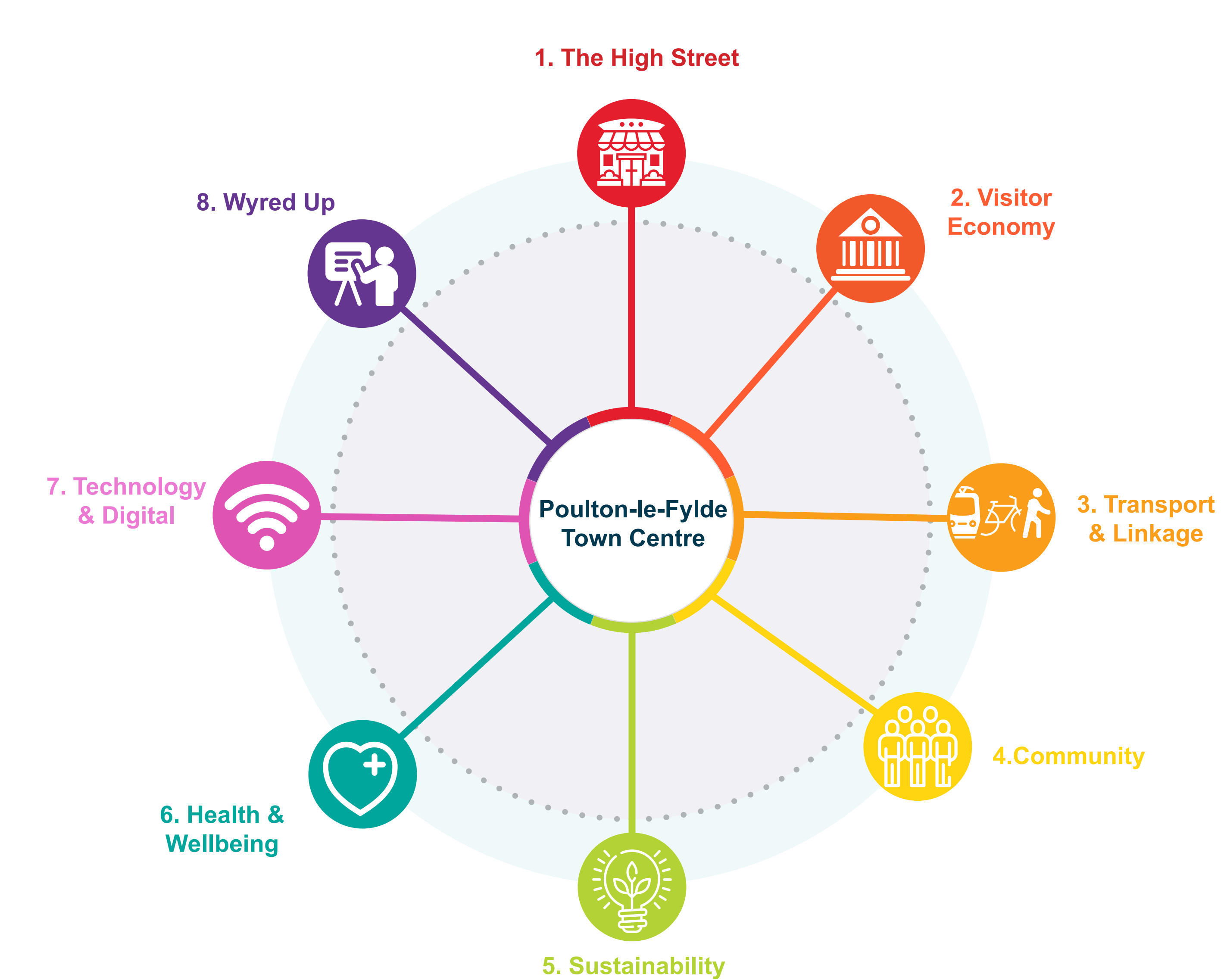
The study is structured around eight 'themes' or areas of interest that are important to the success of the town centre.

A number of proposed interventions will be delivered by community stakeholders, alongside public and private sector support. If you are interested in contributing or becoming a partner to help deliver these interventions, please get in touch.