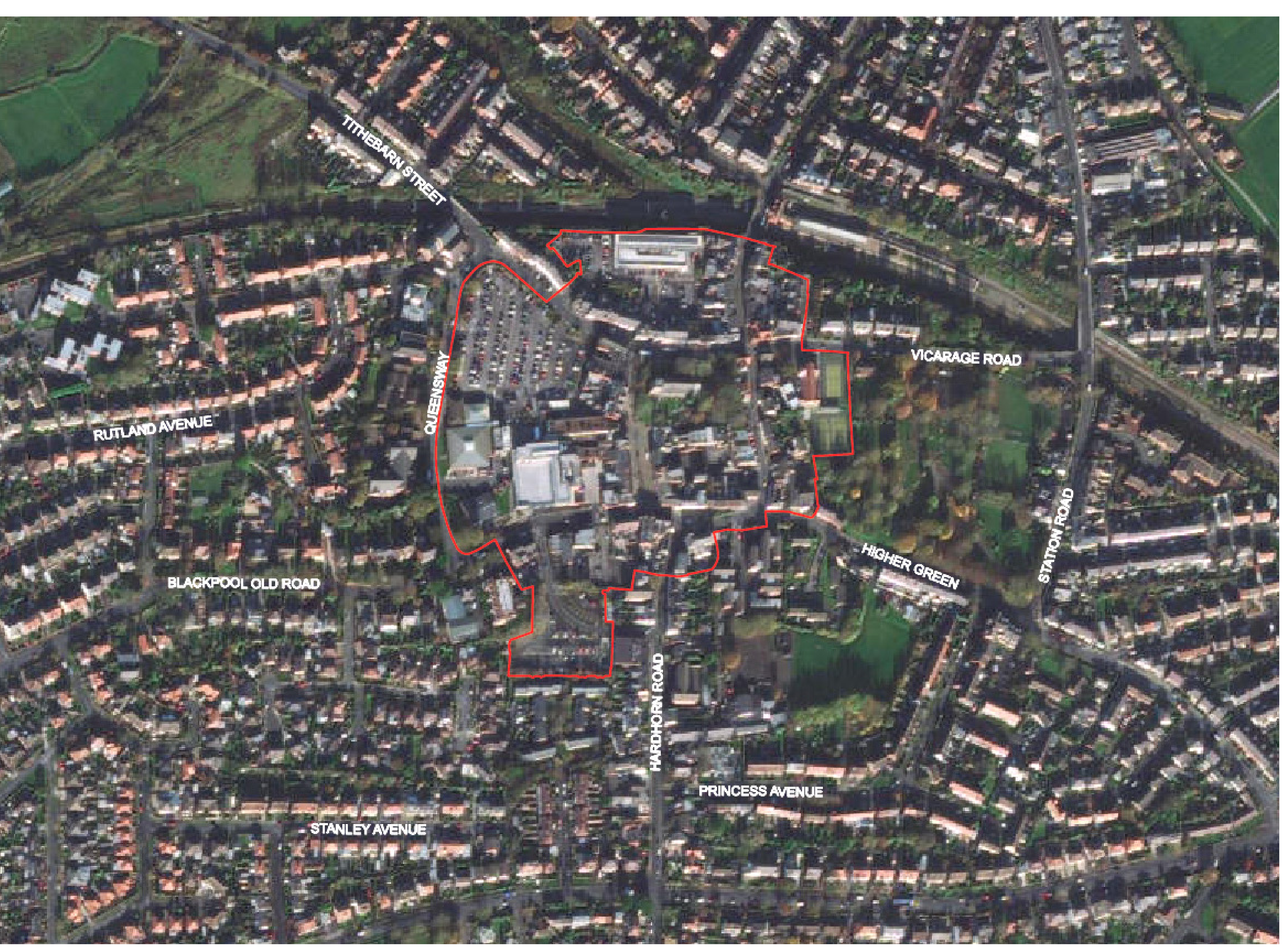
Existing Poulton Town Centre Boundary